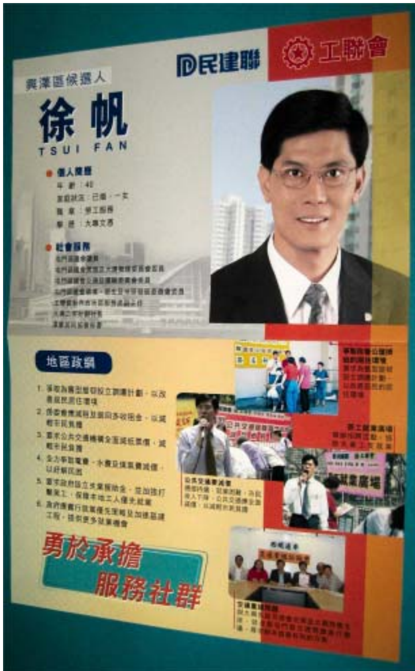
Brief description of the picture (preferably in less than 100 words)