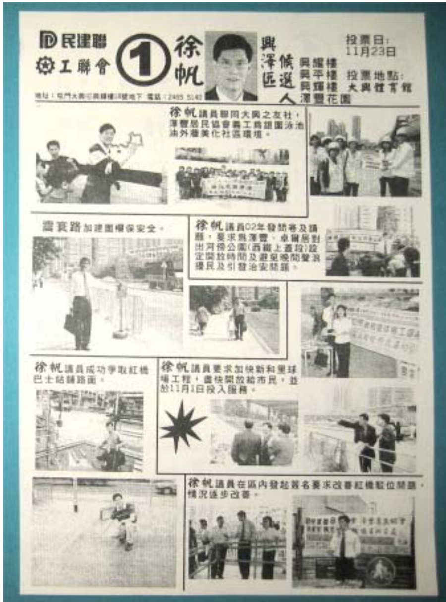
Brief description of the picture (preferably in less than 100 words)