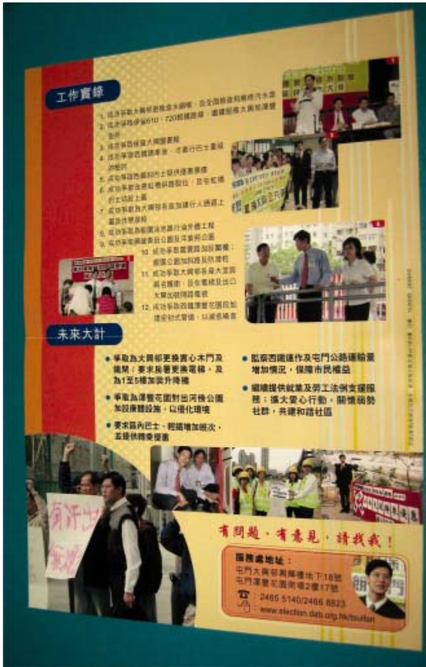
Brief description of the picture (preferably in less than 100 words)