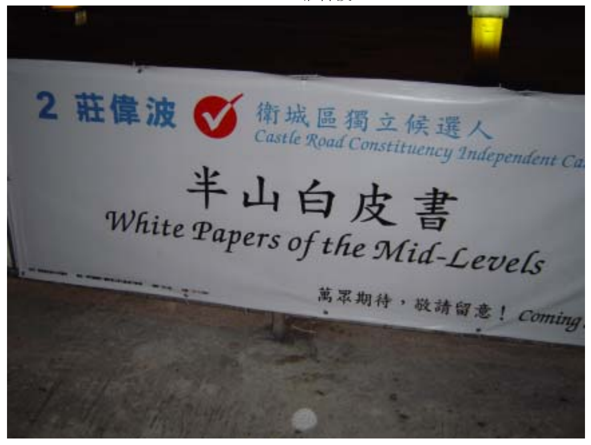
Another version of 莊偉波's banners

Code of picture submitted :_DSC01254 Date taken/scanned :_Nov 19 Time :_~7pm Venue : __Across the road to YWGS (poll station) Brief description of the picture (preferably in less than 100 words)