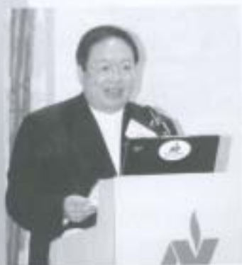
民政事務局長何志平 太平紳士主持開幕 The Hon Dr Patrick Ho Chi-ping, JP Secretary for Home Affairs officiating at the Opening

承接於2001年進行的「市民對義務工作意見研究」，本局於2002年11月舉行「香港義務工作研討會」，目的是分享研究結果，從經濟及社會角度檢視義務工作的貢獻。